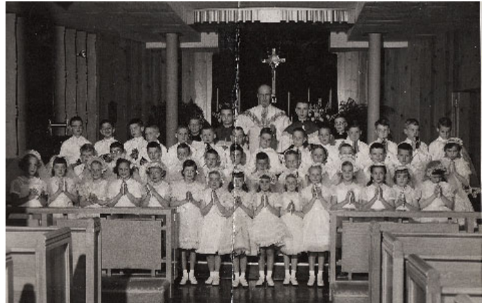
1956 First Eucharist