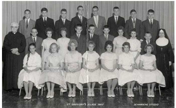
St. Gregory’s 8th Grade Class of 1962